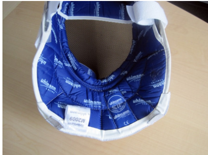
8. This is the result.